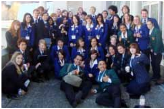
Fraser High and other students at the PTP Summit.