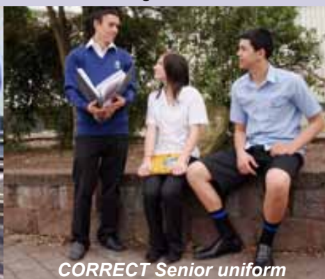
CORRECT Senior uniform