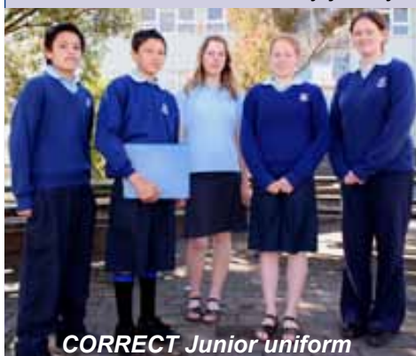
CORRECT Junior uniform

Please do not hesitate to contact the school if you have any queries, or would like a copy of the uniform regulations.